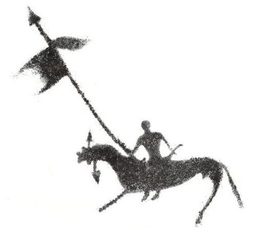
Figure 2. Flag bearer

One of the following works of the Turkic period is "Flag bearer" (Figure 2) [4; 26]. Petroglyphs are depicted on the rocks of tanbaly, south-eastern part of Mount Shuili. Petroglyphs are best described in Maksimova, Yermolaeva and Maryashev's work "On rock carvings". The body of the horse is long and slender, the neck is flat, the legs are thin, and the front legs are long. The tail is thin and curly. The wings are proportionate. At first glance, it is impossible to understand the basic image of a horse. The rider's shoulders are broad and curved. The image of a flag in one hand and a sword in the other as if describing the motto.