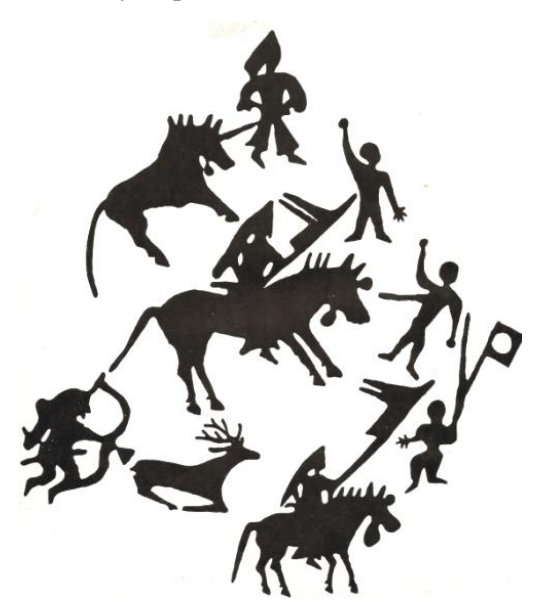
Figure 1. The glory of the ancient Turks

"The glory of the ancient Turks" (Figure 1). Petroglyphs were found in the north-western part of southern Kazakhstan, Mount Kindyktas, and the Trans-Ili Alatau. The mentioned petroglyph is presented as an album with an etching pattern on the page of Medoev A.G. "Engravings on rock" and a scientific reference to it. The author, combining this picture on the stone and the two petroglyphs that we consider, suggests the following scientific thought: "The ancient Turkic petroglyphs reflect the great dream and power of the main figures of the country. Therefore, we can say that the images of the Turkic stone figures of argymaks of noble origin, men with flags in their hands, and religious and mythological images related to Umai reflect the appearance of the Turkic era. Most importantly, in science, images on the stone can be studied as a diplomatic document or a history of politics" [4].