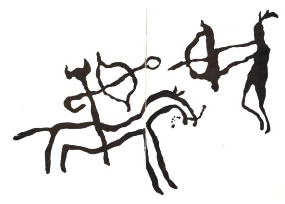
Figure 3. The war of horsemen and foot archers

The next petroglyph is "The war of horsemen and foot archers" (Figure 3) [4; 32]. Tamgaly is the south-eastern part of Mount Shuili. Mount Anyrakay is located about 170 km northwest of Almaty. An unknown artist, who painted two soldiers with bows, used two different techniques for drawing. The Archer on the horse is executed only on contour lines. The Walking Archer is depicted in the silhouette technique as a spot. The hats of the two soldiers are different. An archer on the horse looks like a soldier with two horns. The head of the second archer is shaped like a helmet. In the same way, the Bow Arrow is different and clearly visible. The head of a mounted archer resembles a round arrow of a foot archer.